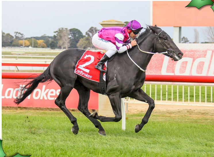
Fighting Harada who is set to return to Caulfield early in the New Year!