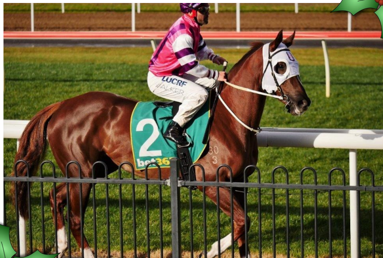
Gorgeous mare Exflytations looks set for another good campaign in 2019!

does look set for a great prep ahead. She is a few weeks away from trialling but does look as though she has come up well and 2000 metres plus will be her aim again this time around. This will most likely be her last prep before she heads off to stud next year and is well placed to improve on her current record of 22 starts for 4 wins, 3 seconds and 4 thirds for $101,250 in stakes. The same could be said for FRONT PAGE NEWS who is starting to take steps in the right direction regarding his racing career. Improving at each of his 3 career runs to date FRONT PAGE NEWS was very good at his latest start running 2nd at Seymour recently and looks a big improver heading into 2019 as he learns his craft over the staying trips!