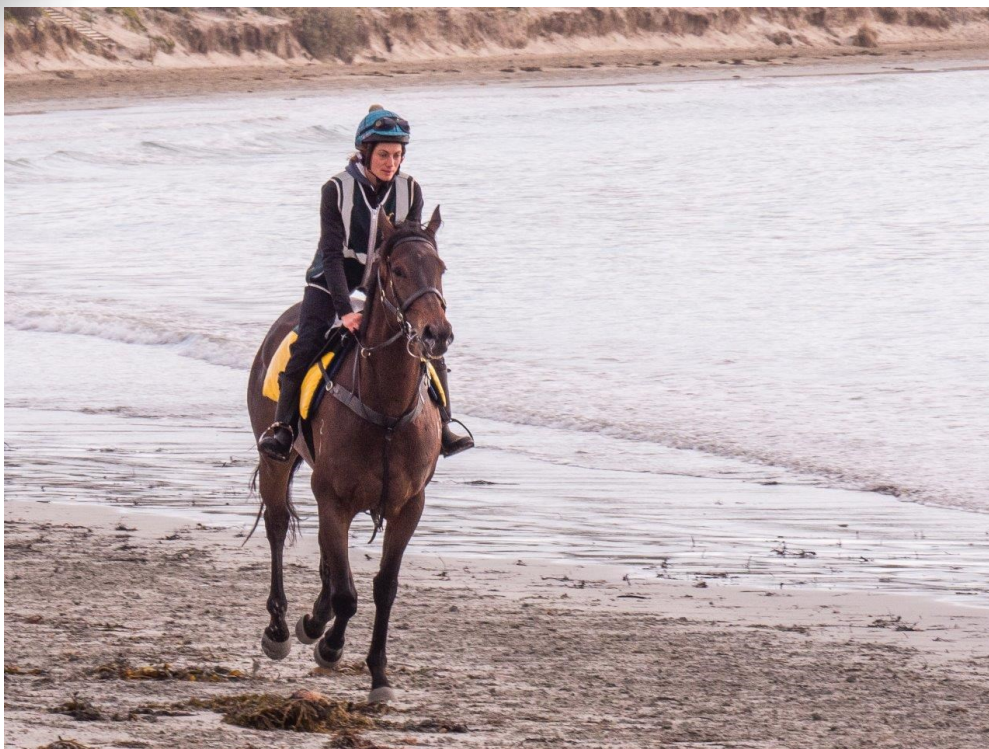
Miss Chierro clearly loving Mick's new Warrnambool beach facility