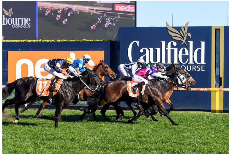
GROUP 3 McNeil Stakes Winner Immortal Love resumes work Jan 2021