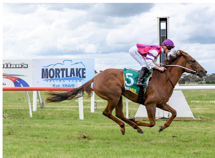
Miss Damita-Mortlake Cup winner and a horse to follow heading into the New Year!

On a positive note SCORPIUS and FIGHTING HARADA are both in pre training and both horses are flying. FIGHTING HARADA who has not raced for over 2 years now is one of those horses that a Syndicate have shown outstanding faith and patience with and I just hope that the patience is rewarded for a wonderful group of