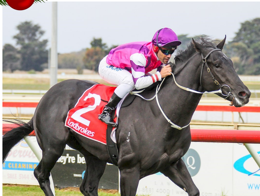
Fighting Harada - looking forward to his return in 2021!