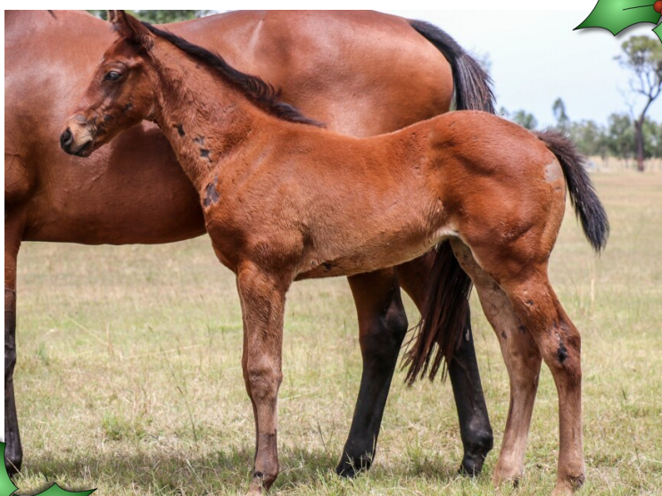
King's Legacy/Loveyamadly filly at 2 months

Two home bred yearlings who will be heading to the Ledgers for breaking in the New Year include our SO YOU THINK/LOVEYAMADLY filly and our MAGNUS/LIBERTY MADE colt. These are two lovely homebreds who have had a faultless start to life. Our So You Think filly is a lovely filly who has more scope about her than LOVEYAMADLY'S previous foals to date, so we expect her to be a 1600-2000 metre filly in time which was the expectation of the planned mating whilst our MAGNUS/LIBERTY MADE colt is a strong colt that has sprinter marked all over him. He is expected to head to the Ledgers at some point next month to commence the breaking in process and unless his physicality changes, does look a ready-made 2YO assuming he adapts to all that is taught to him from a mental perspective!