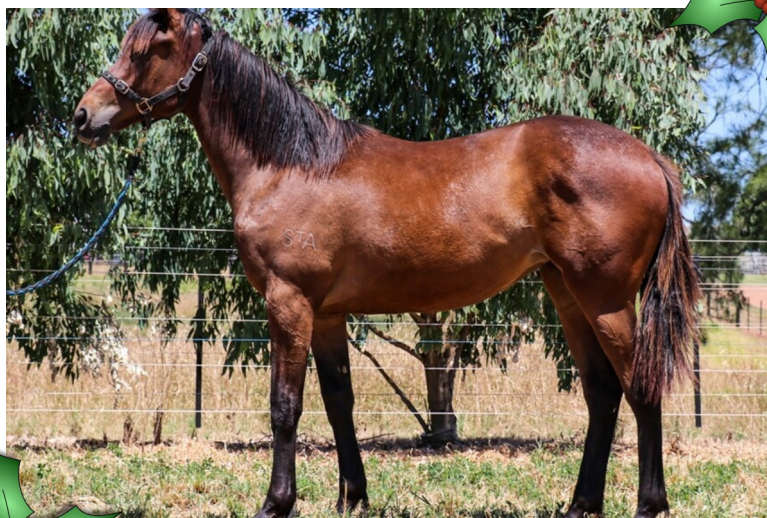
So You Think/Loveyamadly filly December 2022

She is now in foal to Widden Stud stallion DOUBLAND who is a real chance to make it down here in Victoria being a very precocious 2YO and a son of one of Australia's most dominant sources of speed in Not A Single Doubt and was an absolutely cracking son of that sire being the highest priced Not A Single Doubt yearling when sold in 2019 for $1.1 million.