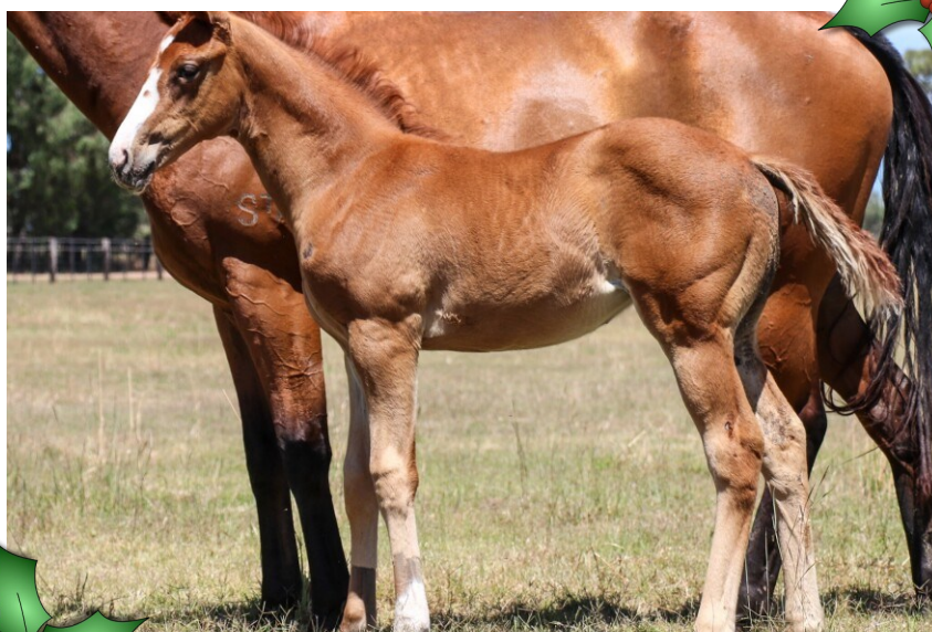
Toronado/Bella Amore filly at 2 months

The 5th October saw UNDOUBTEDLY SO give birth to her first foal, that of a RUSSIAN CAMELOT colt very much in the mold of her mother with a lovely white blaze and pleased to say that she is in foal to MAGNUS which is a really great mating for her which the Syndicate is expecting to race and who has just come off another terrific season having sired 5 Stakes winners and a further 6 Stakes placed horses throughout the 2022/23 season. The 16th of October saw our jewel in the crown mare LOVEYAMADLY foal a lovely KING'S