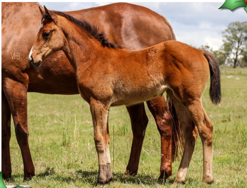
King's Legacy/Miss Damita filly at 2 months