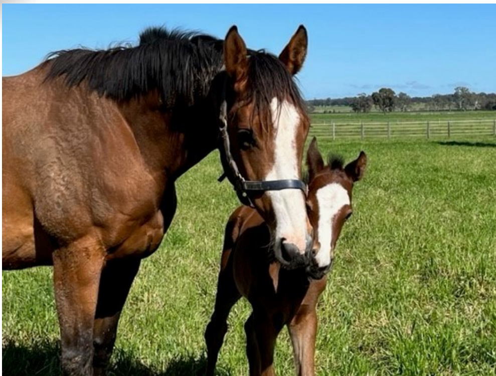
Russian Camelot/Undoubtedly So colt