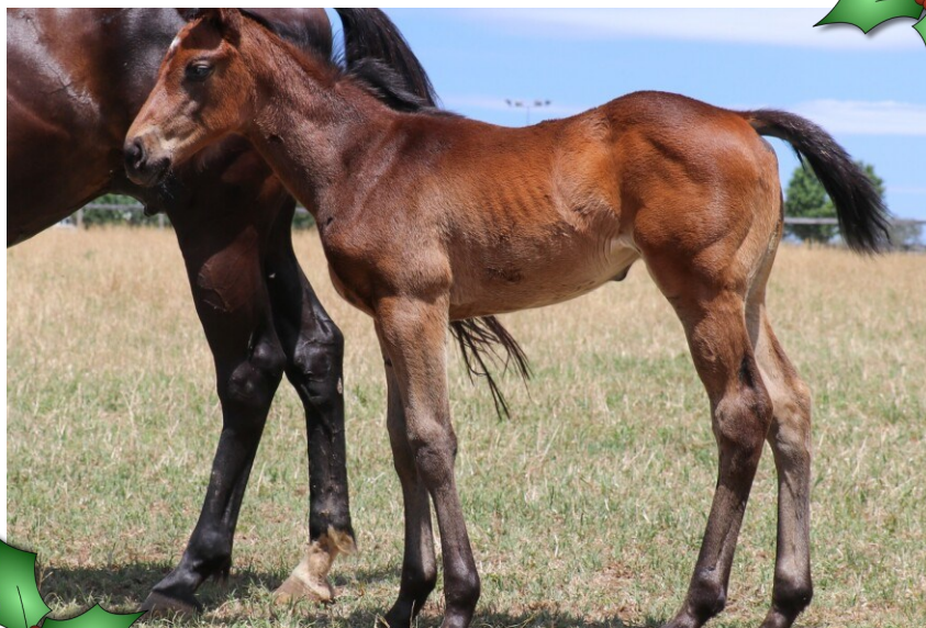
Doubtland/Liberty Made filly

MISS DAMITA - KING'S LEGACY filly heading to the Sydney Classic sales Feb 12, and in foal to IN THE CONGO .