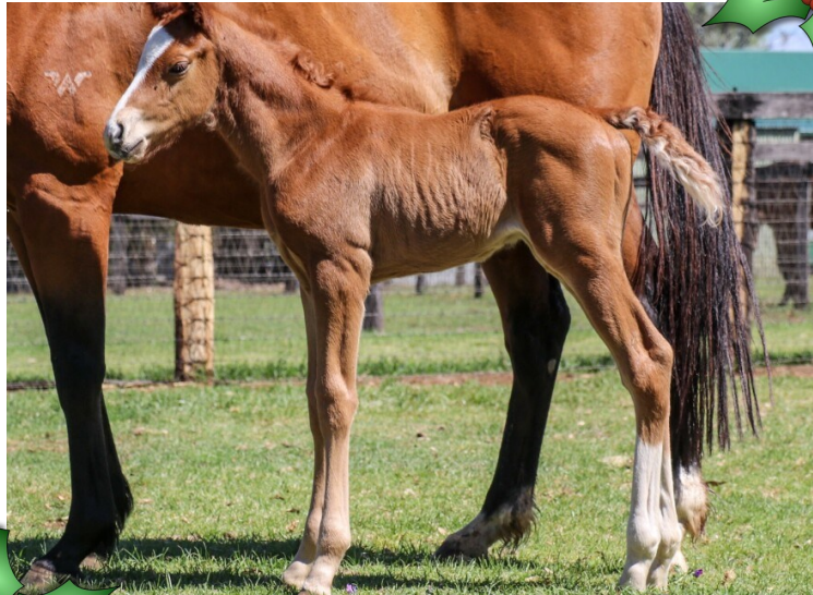
Magnus/Undoubtedly So colt

Written By, as a stallion is doing an outstanding job at stud, particularly with his three-year-olds (which is surprising that he himself was such a brilliant two-year-old) and is currently sitting equal 3rd by winners on the second season sire's tables with brilliant dual Stakes winning 3YO WA galloper Ripcord currently being his showcase performer!