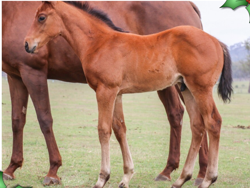
Exceedance/Miss Damita colt